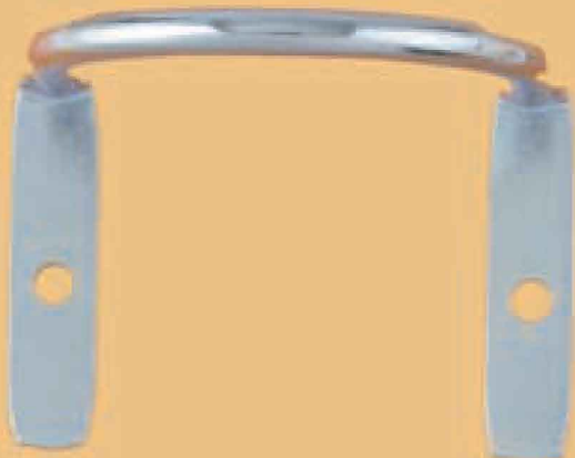
REF. 5008 / 45 PIQUETE FLEJE